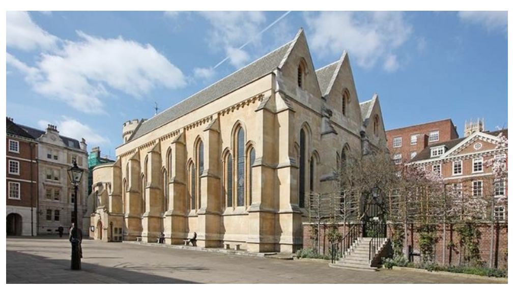
The Temple Church, London, Great Britain