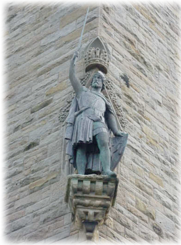
Sir William Wallace

The third and comprehensive architectonic point to be grasped is this: Communism and Mohammedanism are religions of evil. Their twin facilitating ideologies of diversity and multiculturalism have compromised the Force Security of United States Armed Forces and the National Security of the United States of America . An insecure Army is no Army . A Nation with an insecure Army is not a Nation , it is a killing zone.