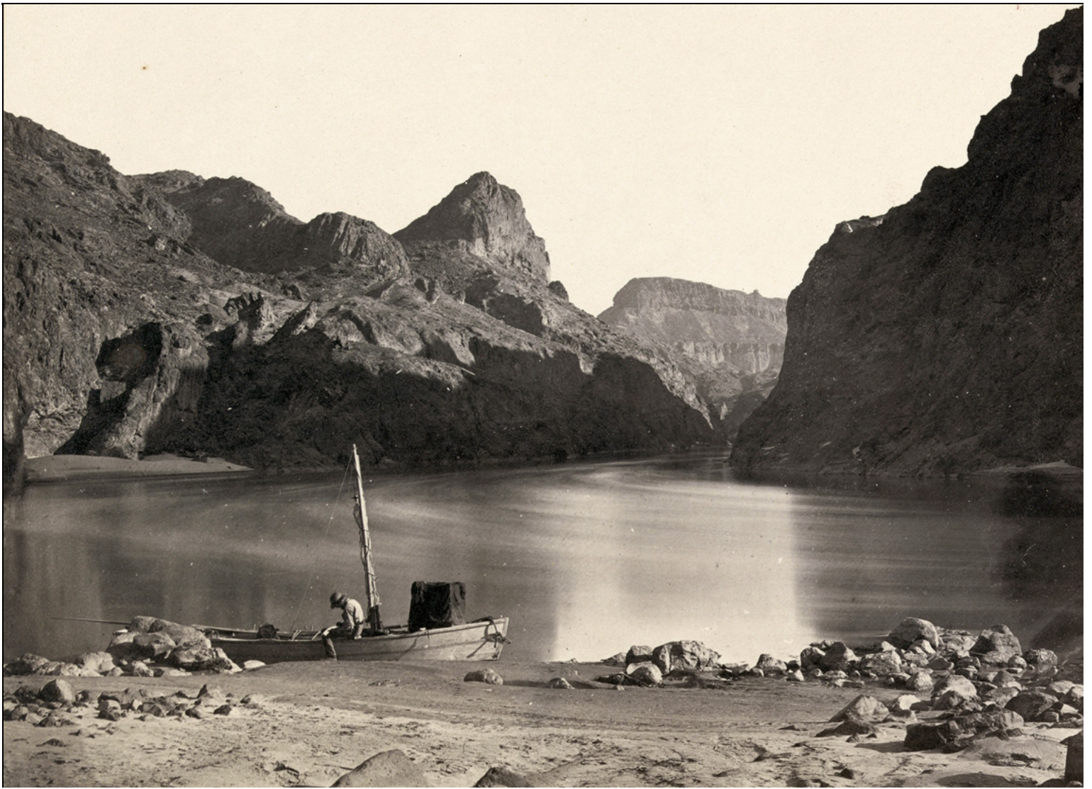
A man sits in a wooden boat with a mast on the edge of the Colorado River in the Black Canyon, Mojave County, Arizona. At this time, photographer Timothy O'Sullivan was working as a military photographer, for Lt. George Montague Wheeler's U.S. Geographical Surveys With the One Hundredth Meridian. Photo taken in 1871, from expedition camp 8, looking upstream.