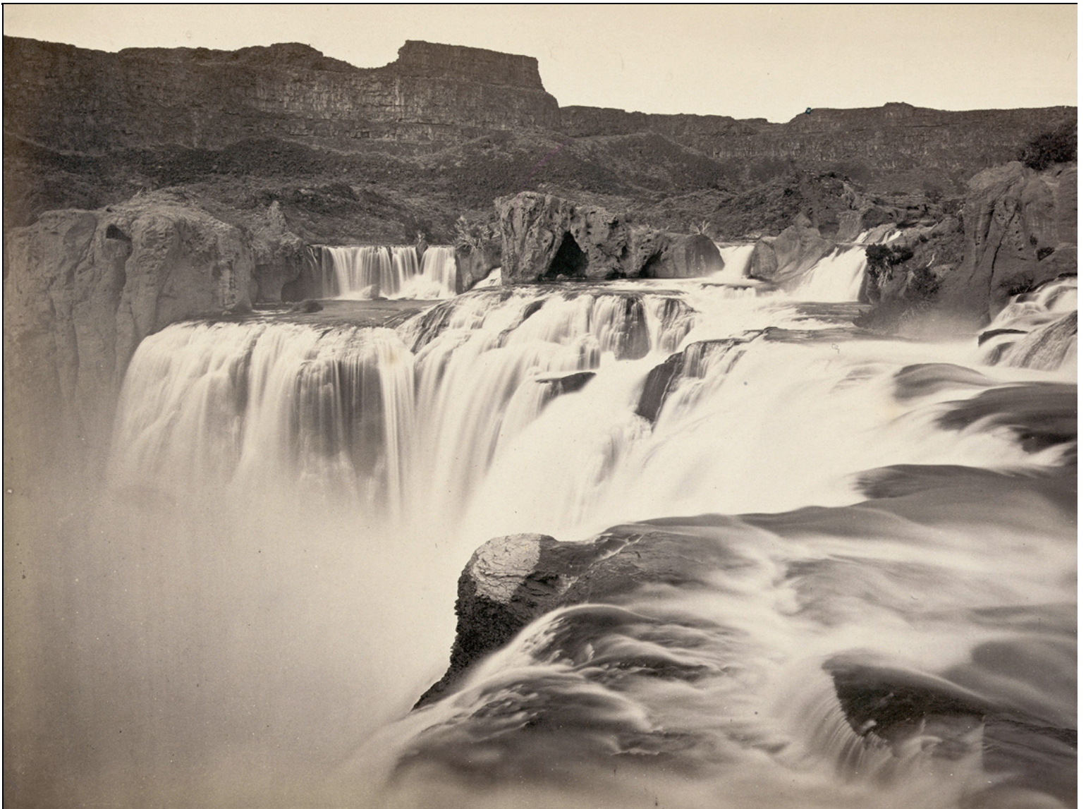
10 Shoshone Falls, Snake River, Idaho. A view across top of the falls in 1874. #