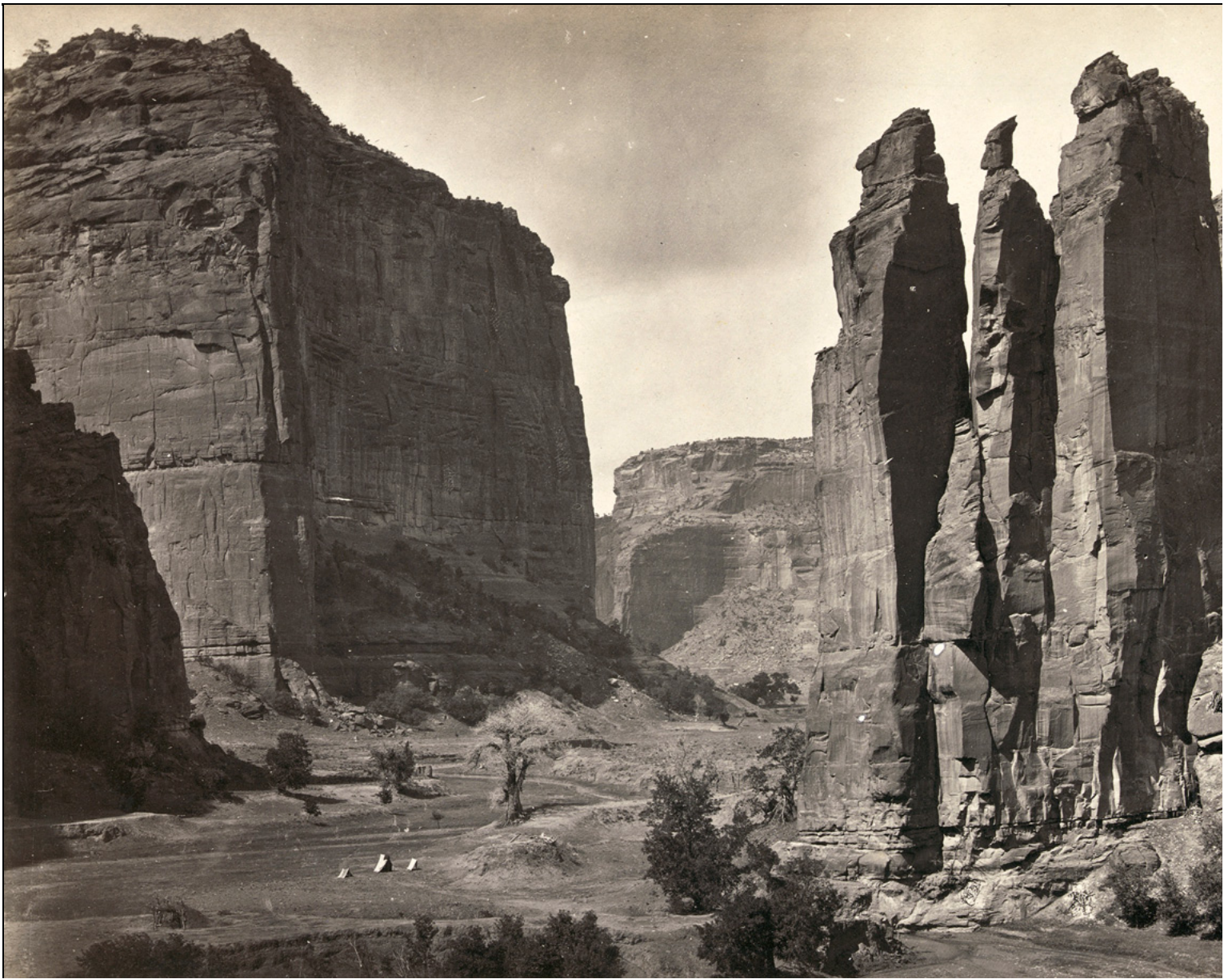
6 Panoramic view of tents and a camp identified as "Camp Beauty", rock towers and canyon walls in Canyon de Chelly National Monument. Tents and possibly a lean-to shelter stand on the canyon floor, near trees and talus. Photographed in 1873. #