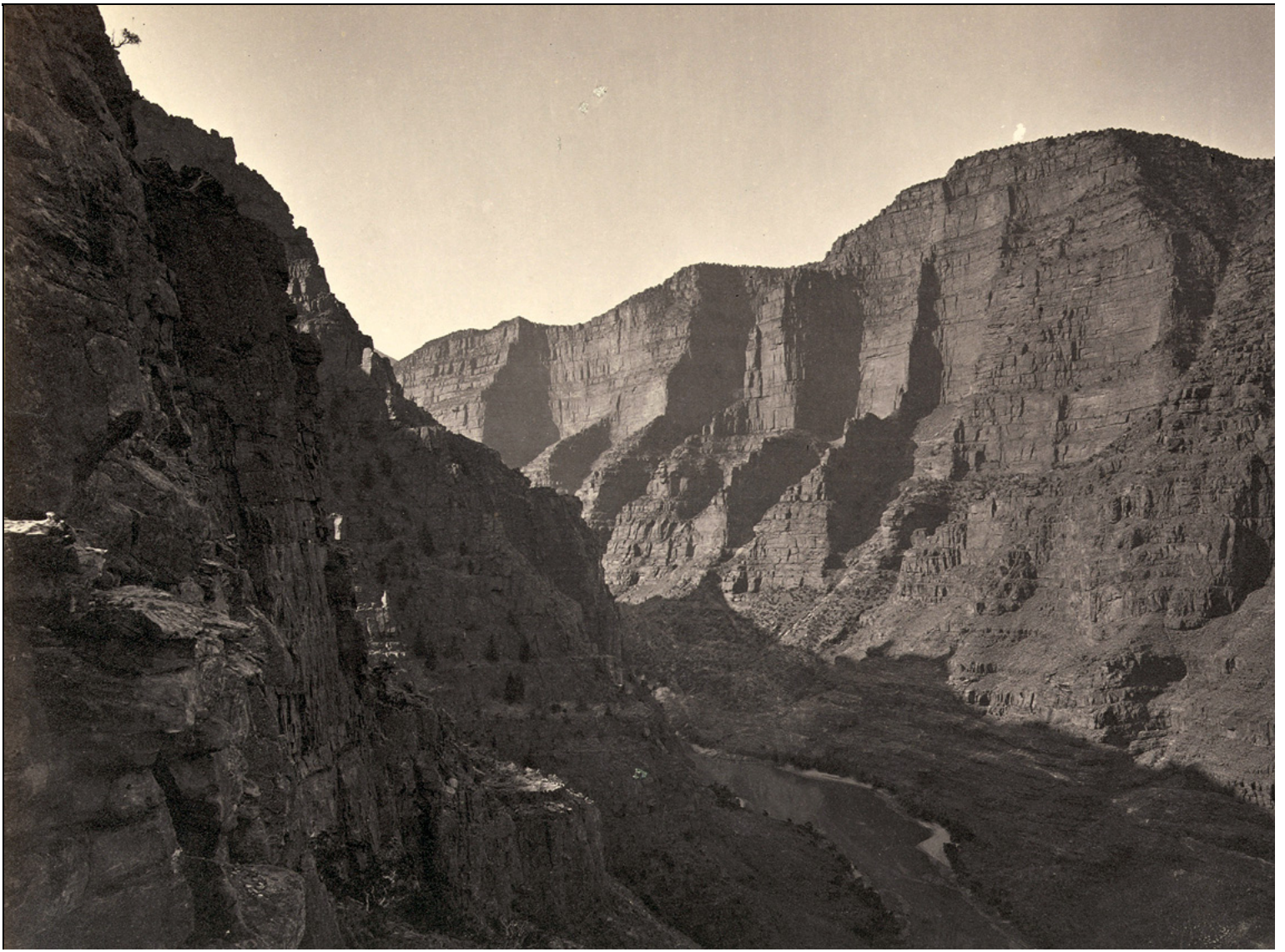
22 The Canyon of Lodore, Colorado, in 1872. #