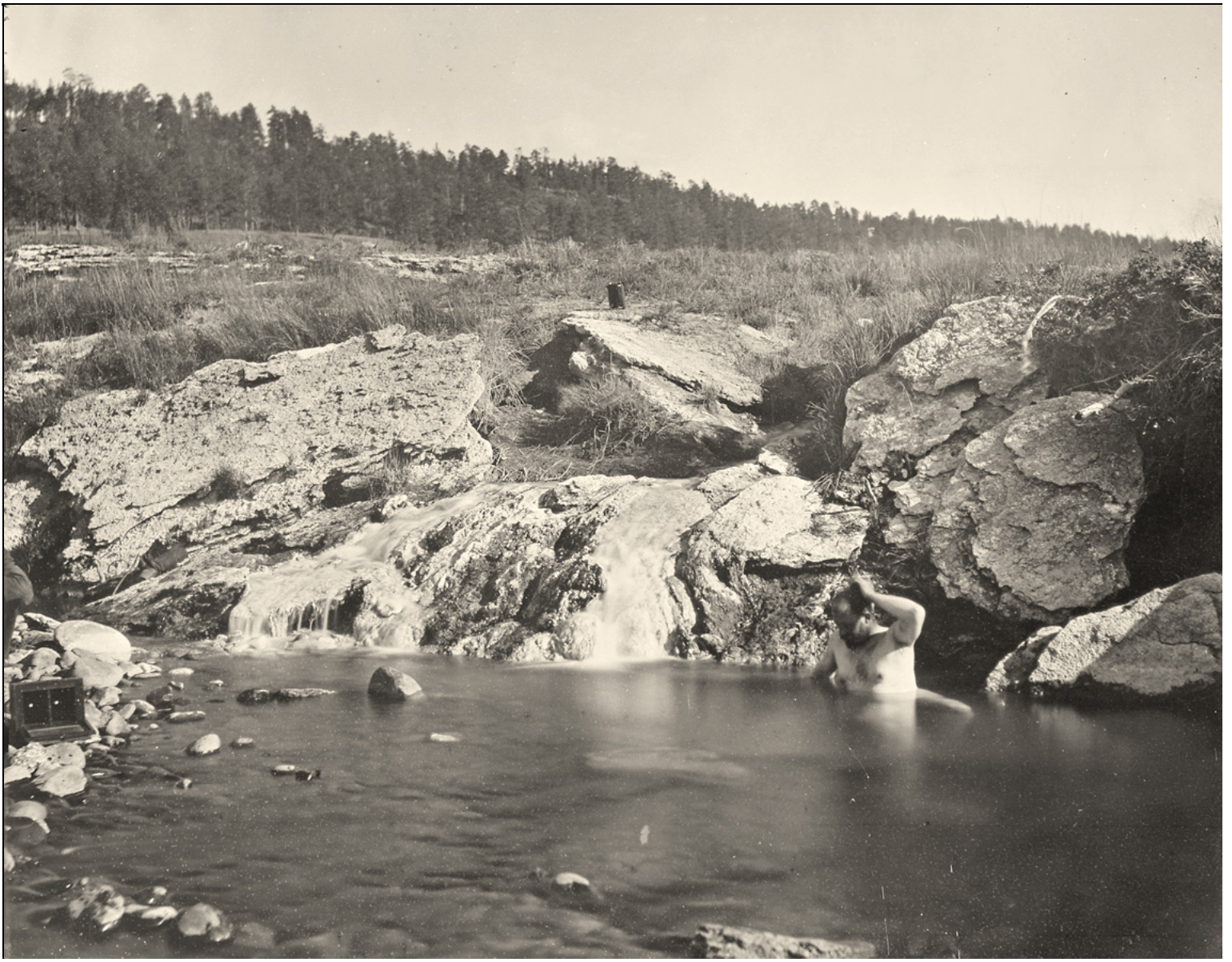
25 Man bathing in Pagosa Hot Spring, Colorado, in 1874. #