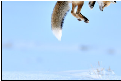
Wildlife Photographer of the Year 2012