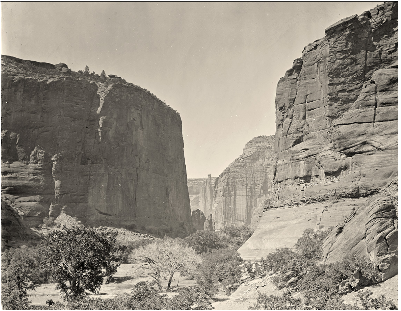
16 The head of Canyon de Chelly, looking past walls that rise some 1,200 feet above the canyon floor, in Arizona in 1873. #