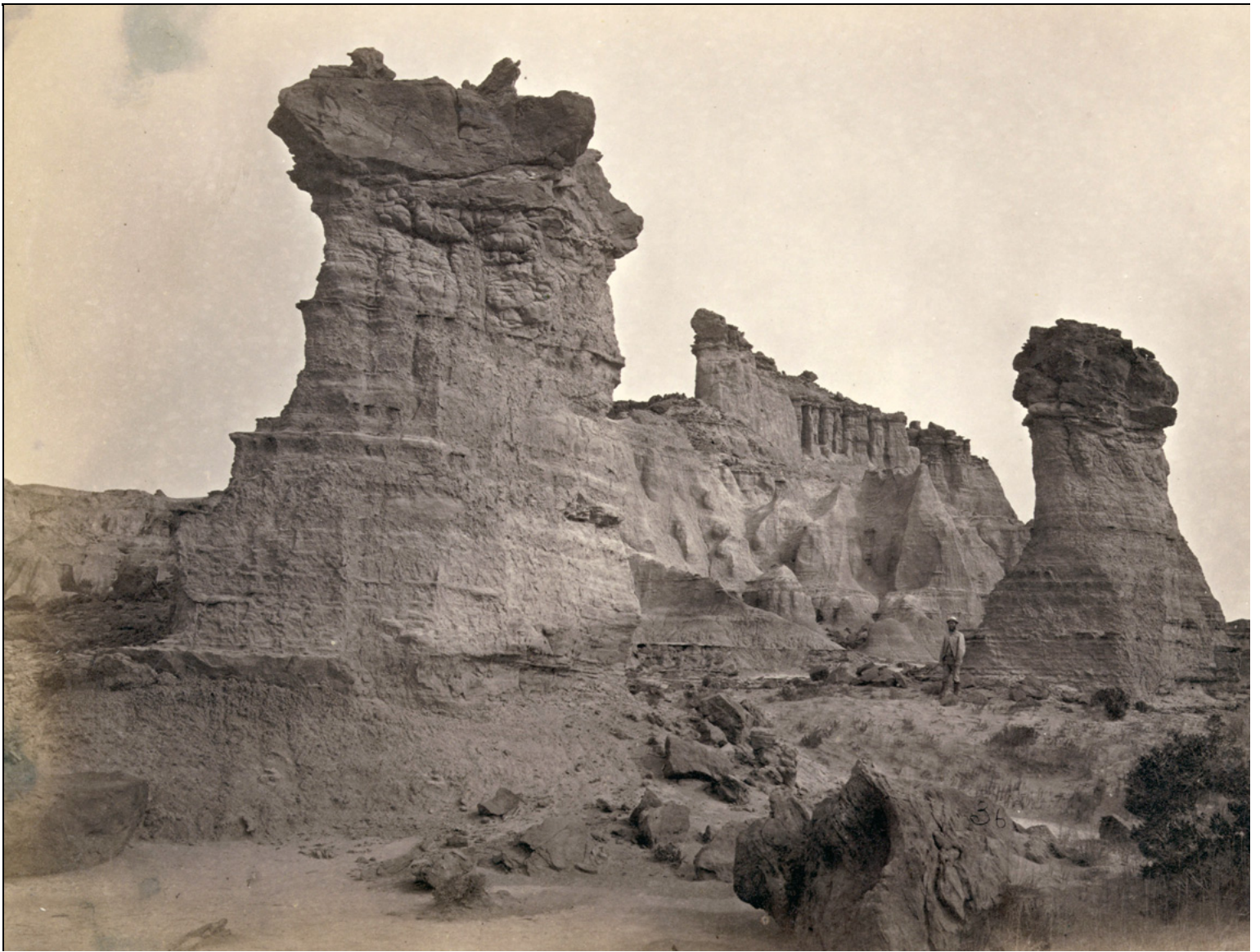
31 Rock formations in the Washakie Badlands, Wyoming, in 1872. A survey member stands at lower right for scale. #