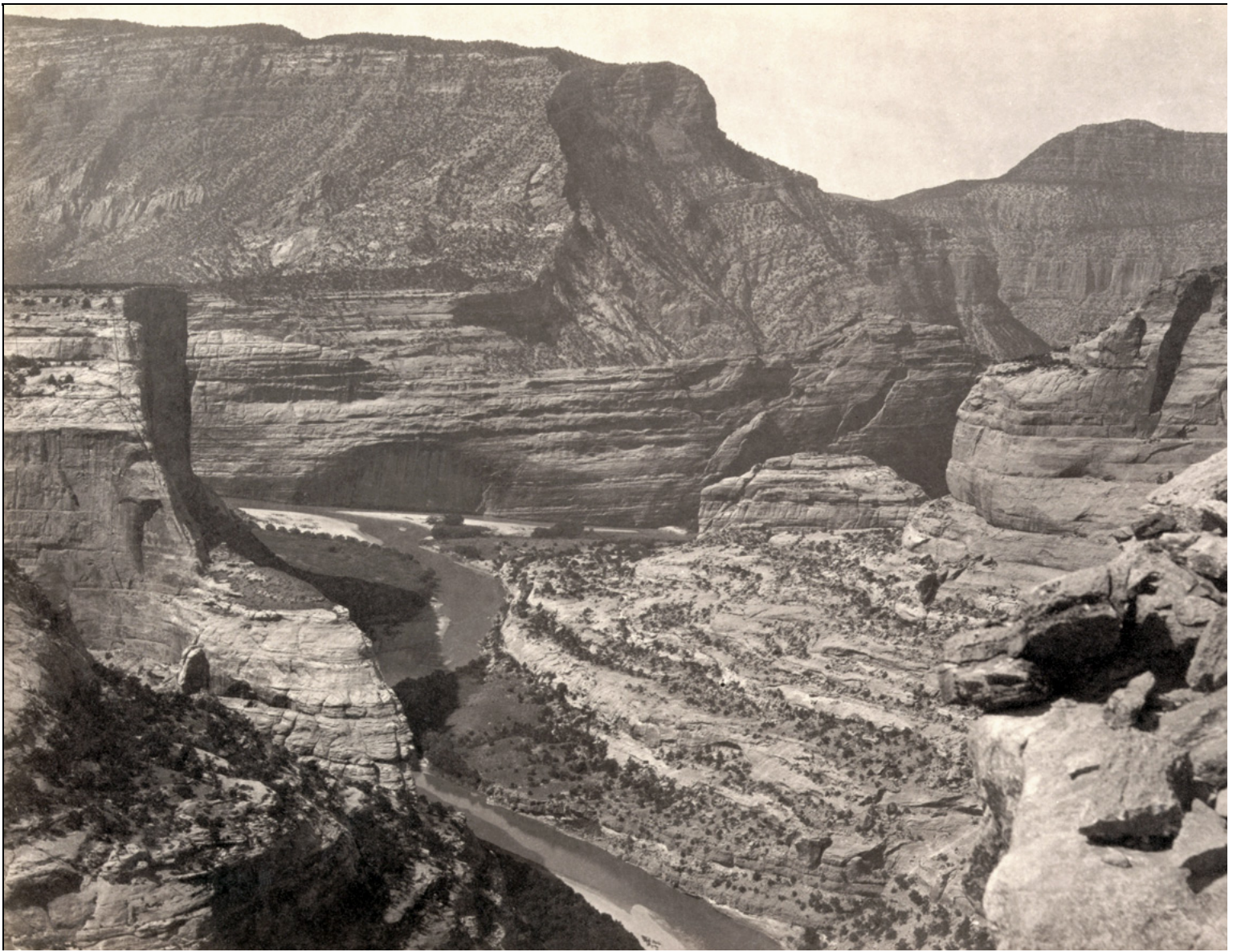
19 The junction of Green and Yampah Canyons, in Utah, in 1872. #