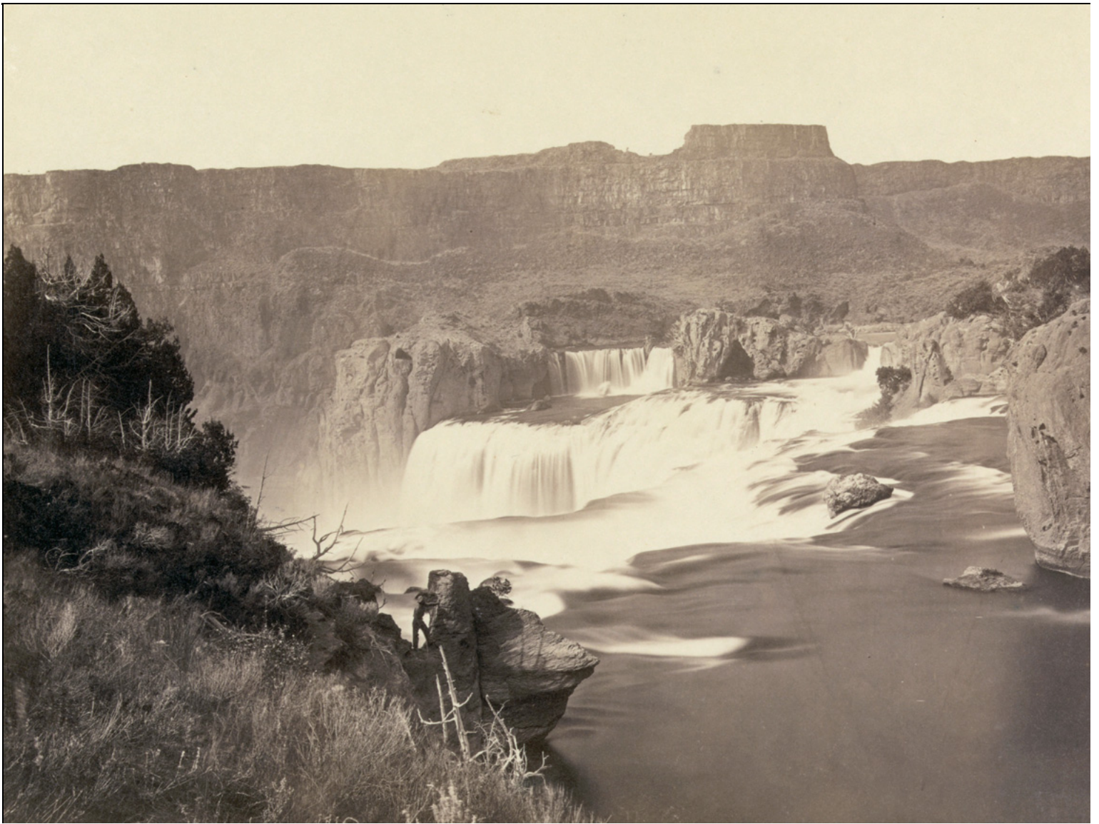
33 Shoshone Falls, Idaho, in 1868. Shoshone Falls, near present-day Twin Falls, Idaho, is 212 feet high, and flows over a rim 1,000 feet #