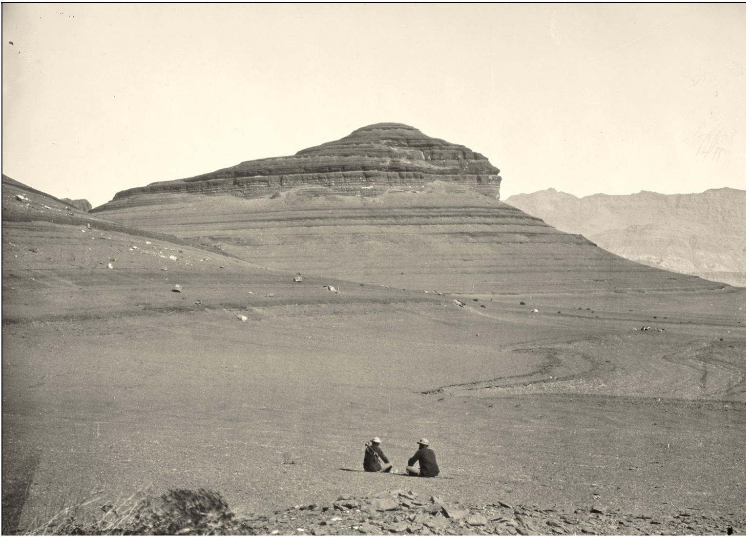
17 Headlands north of the Colorado River Plateau, 1872. (Timothy O'Sullivan/National Archives and Records Administration) #