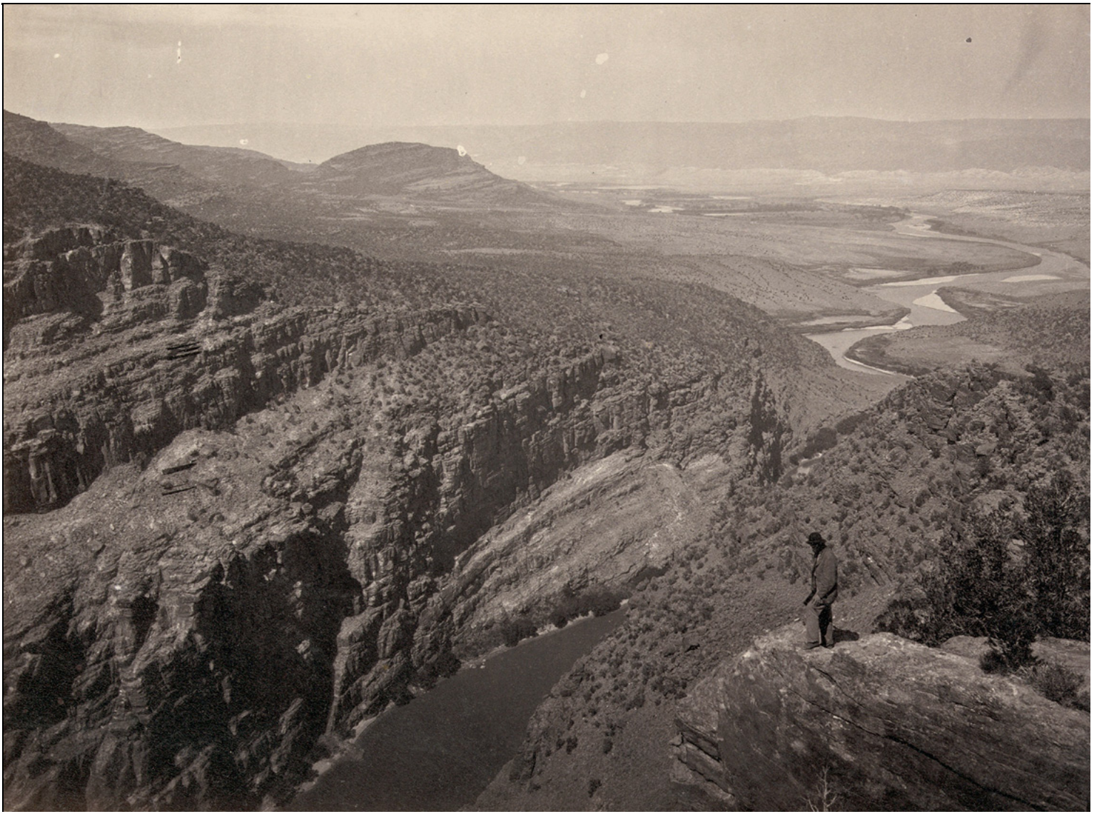
9 Browns Park, Colorado, 1872. #