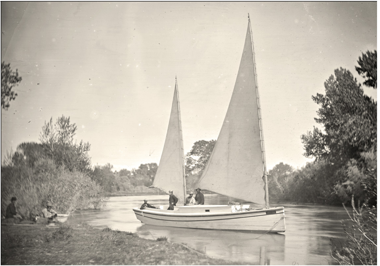
24 The "Nettie", an expedition boat on the Truckee River, western Nevada, in 1867. #