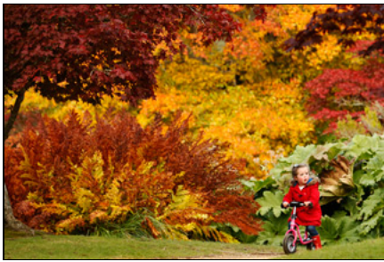
Fall Is in the Air, Part II