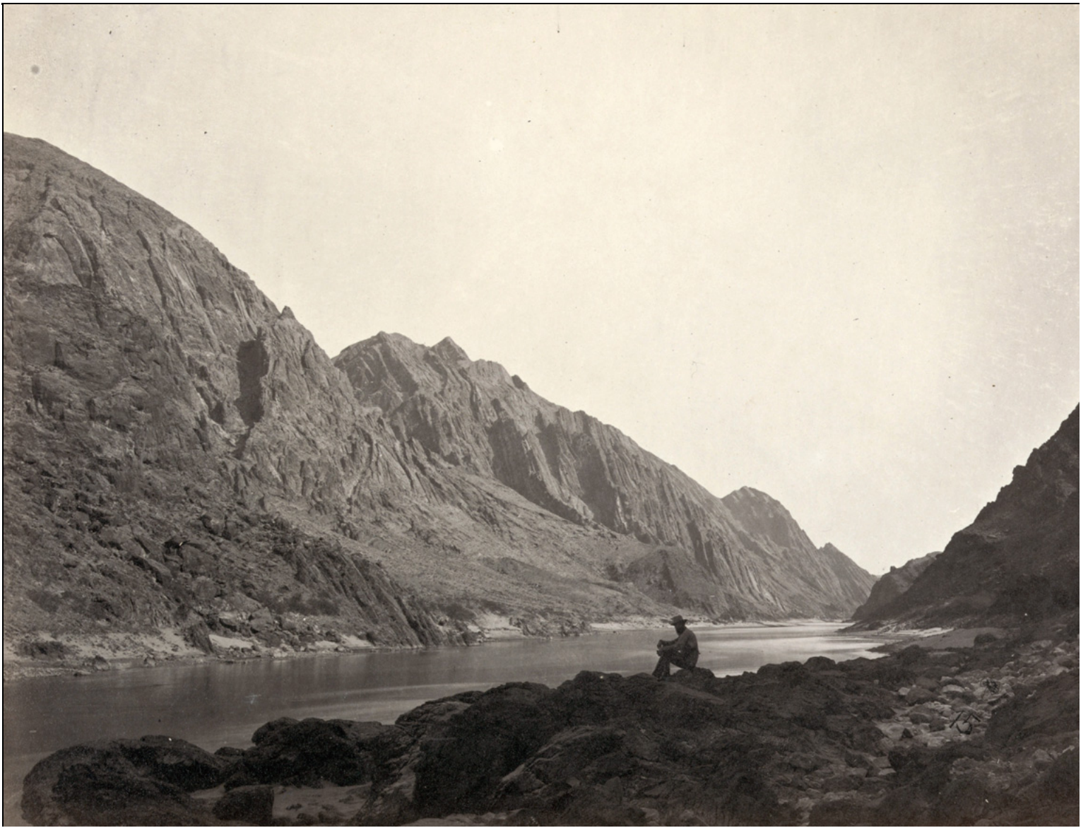
11 A man sits on a rocky shore beside the Colorado River in Iceberg Canyon, on the border of Mojave County, Arizona, and Clark County, 1871. #