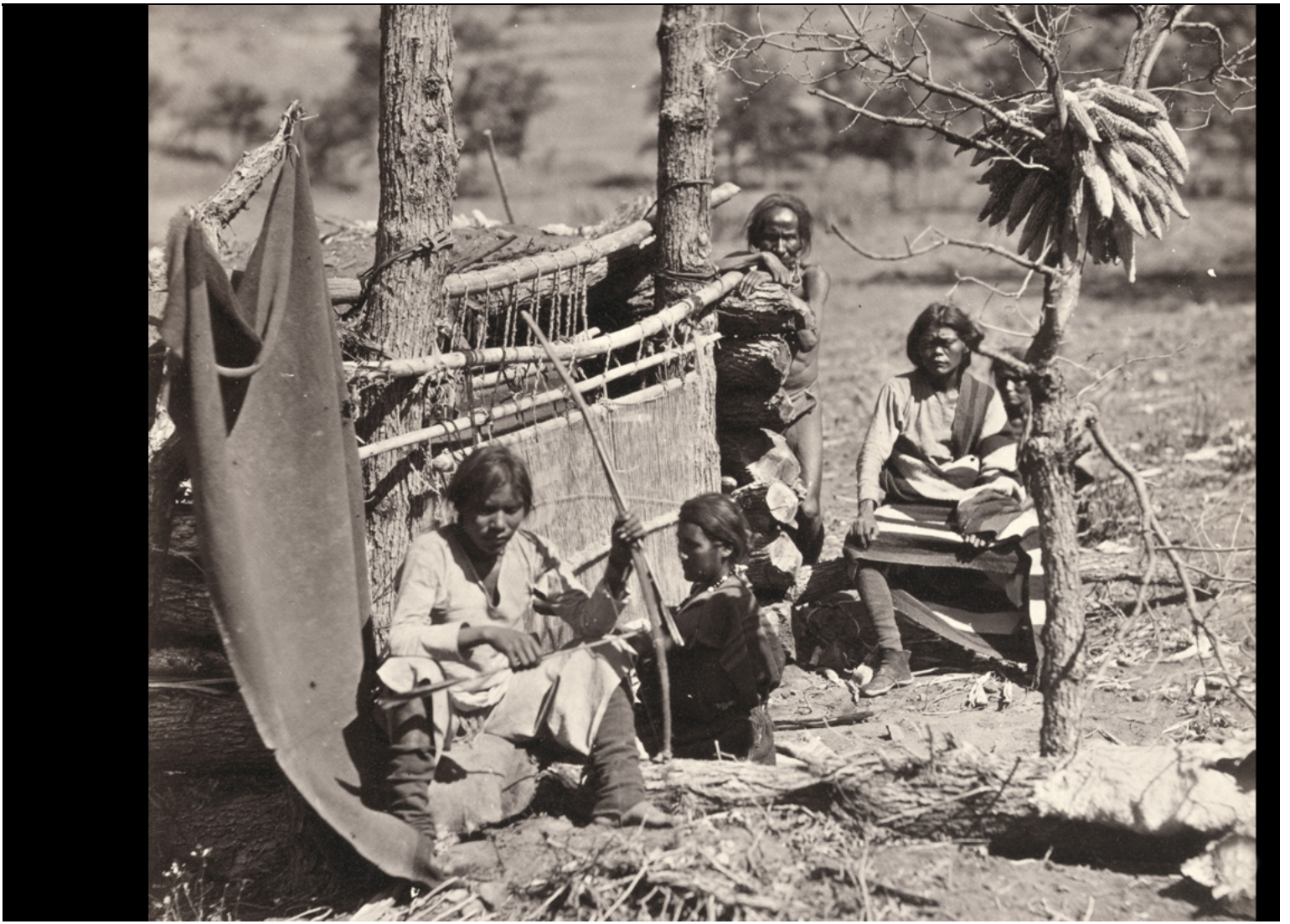
21 Aboriginal life among the Navajo Indians. Near old Fort Defiance, New Mexico, in 1873. #