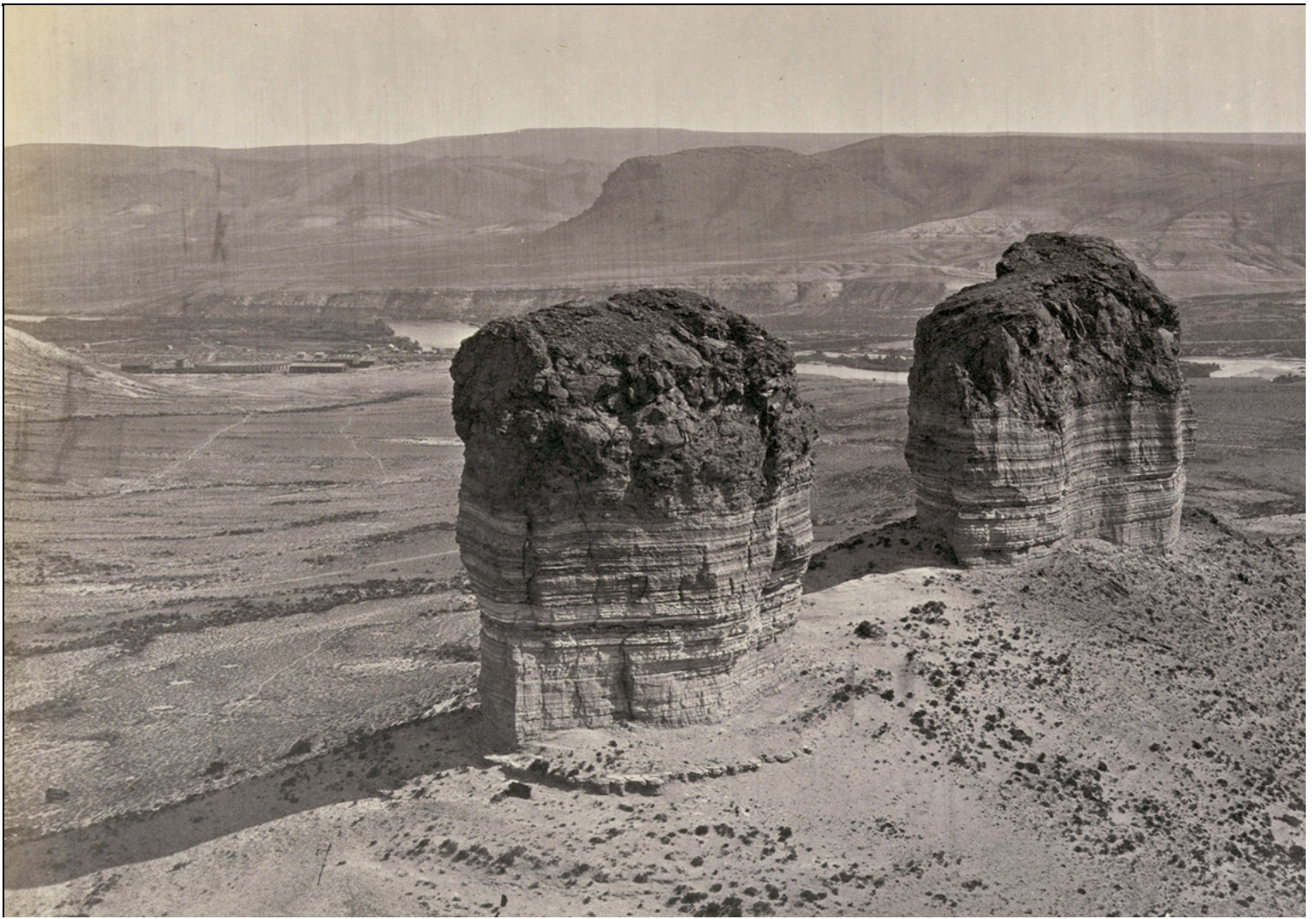
3 Twin buttes stand near Green River City, Wyoming, photographed in 1872. #