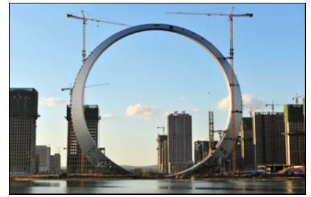
Scenes From 21st-Century China

In Focus is updated with new photo stories nearly every day, checkout the Archives . Follow along on Twitter , Google+ , Facebook , or Tumblr — or subscribe to updates with RSS or Email