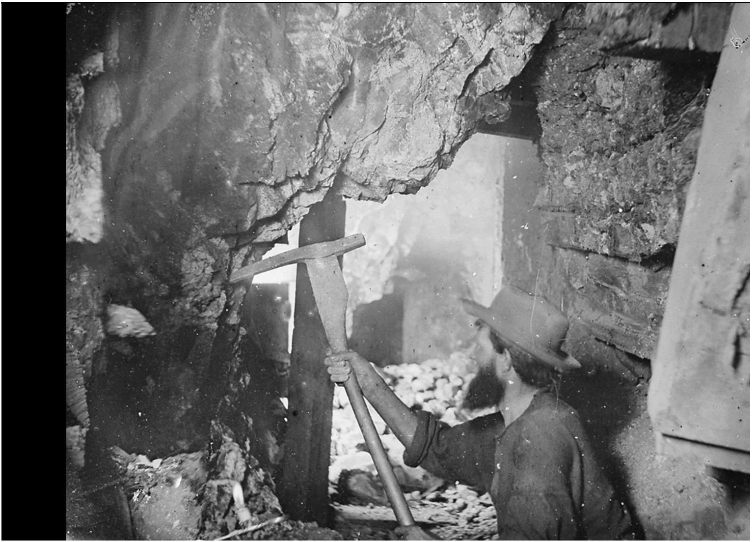
15 In 1867, O'Sullivan traveled to Virginia City, Nevada to document the activities at the Savage and the Gould and Curry mines on the Comstock Lode, the richest silver deposit in America. Working nine hundred feet underground, lit by an improvised flash -- a burning magnesium -- O'Sullivan photographed the miners in tunnels, shafts, and lifts. #