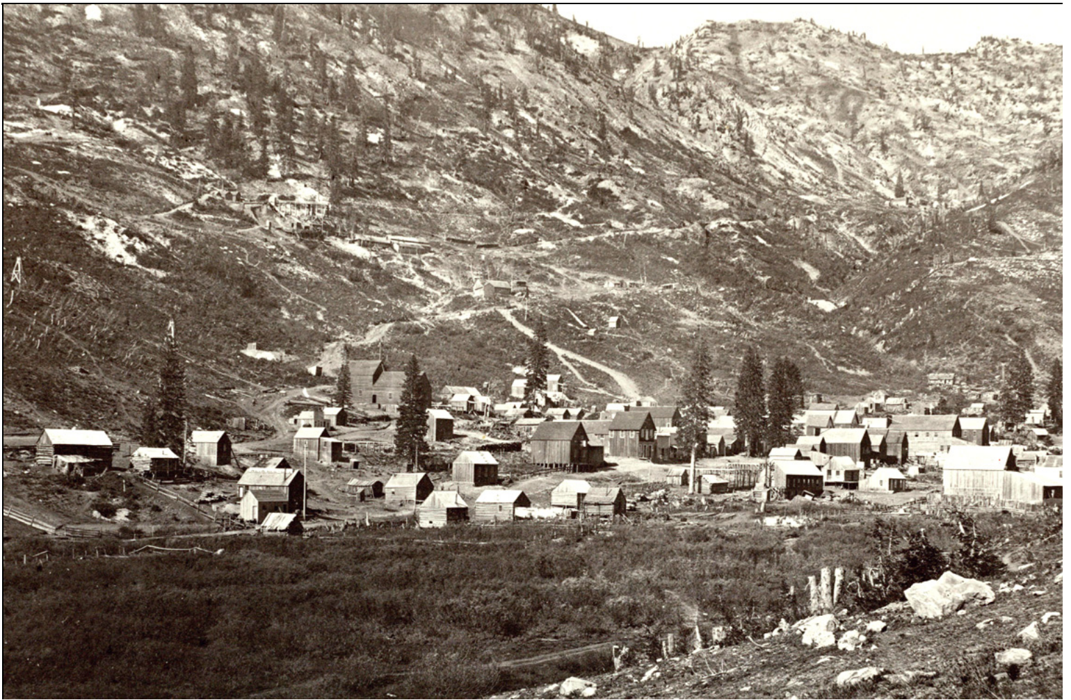
28 Alta City, Little Cottonwood, Utah, ca. 1873. #