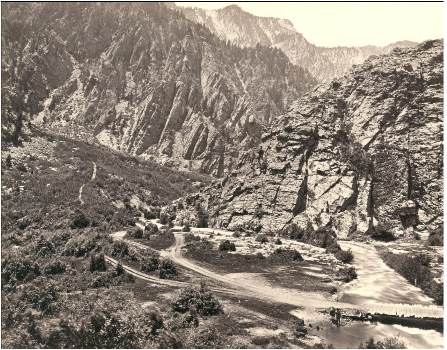
30 Big Cottonwood Canyon, Utah, in 1869. Note man and horse near the bridge at bottom right.