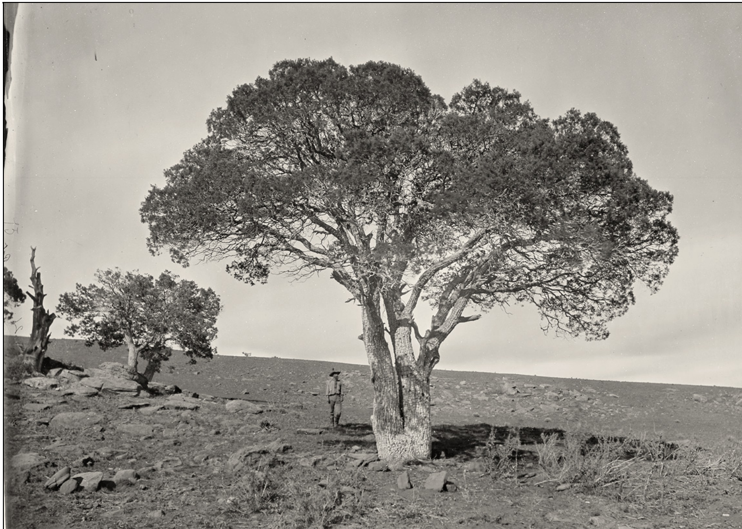
32 Oak Grove, White Mountains, Sierra Blanca, Arizona in 1873. #