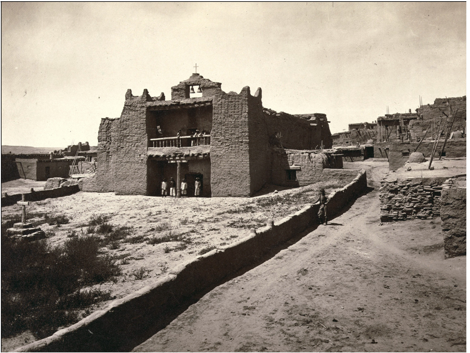
7 Old Mission Church, Zuni Pueblo, New Mexico. View from the plaza in 1873. #