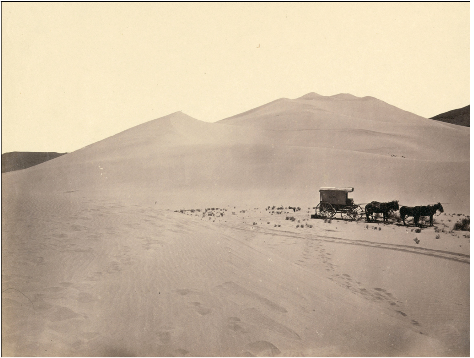
12 Timothy O'Sullivan's darkroom wagon, pulled by four mules, entered the frame at the right side of the photograph, reached the center image, and turned around, heading back out of the frame. Footprints lead from the wagon toward the camera, revealing the photograph. Photo taken in 1867, in the Carson Sink, part of Nevada's Carson Desert. #