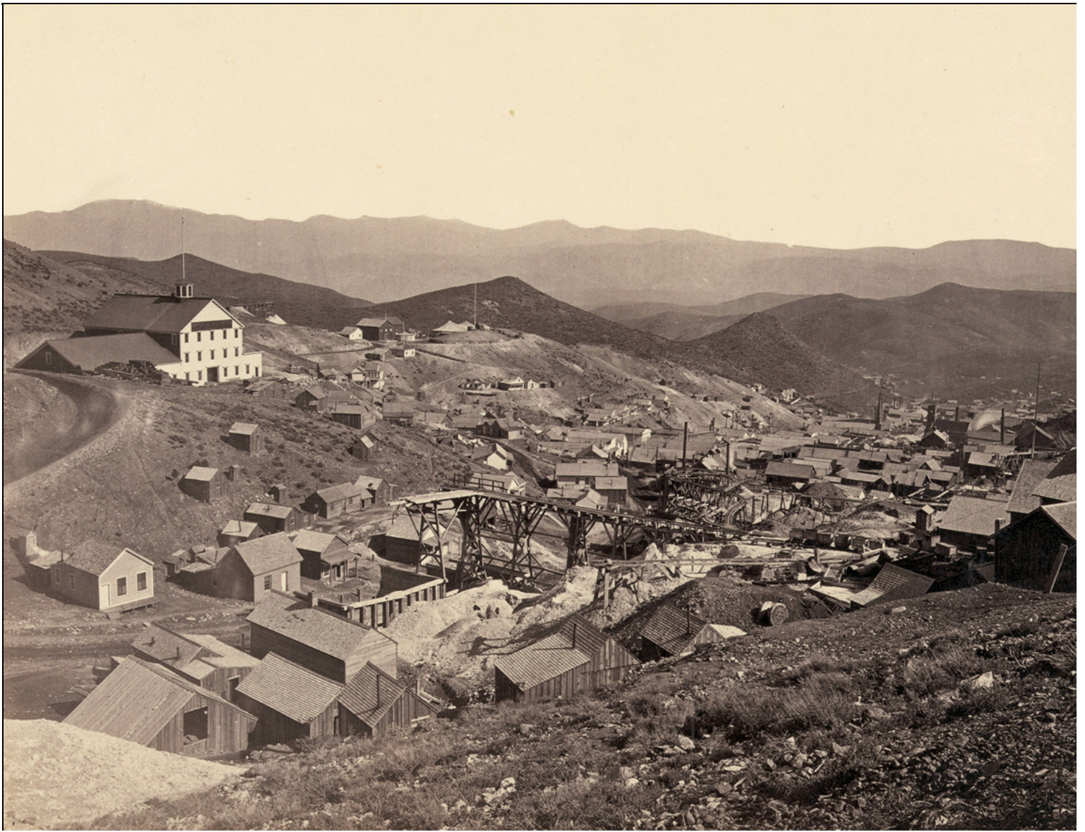
13 The mining town of Gold Hill, just south of Virginia City, Nevada, in 1867. (Timothy O'Sullivan/Library of Congress) #