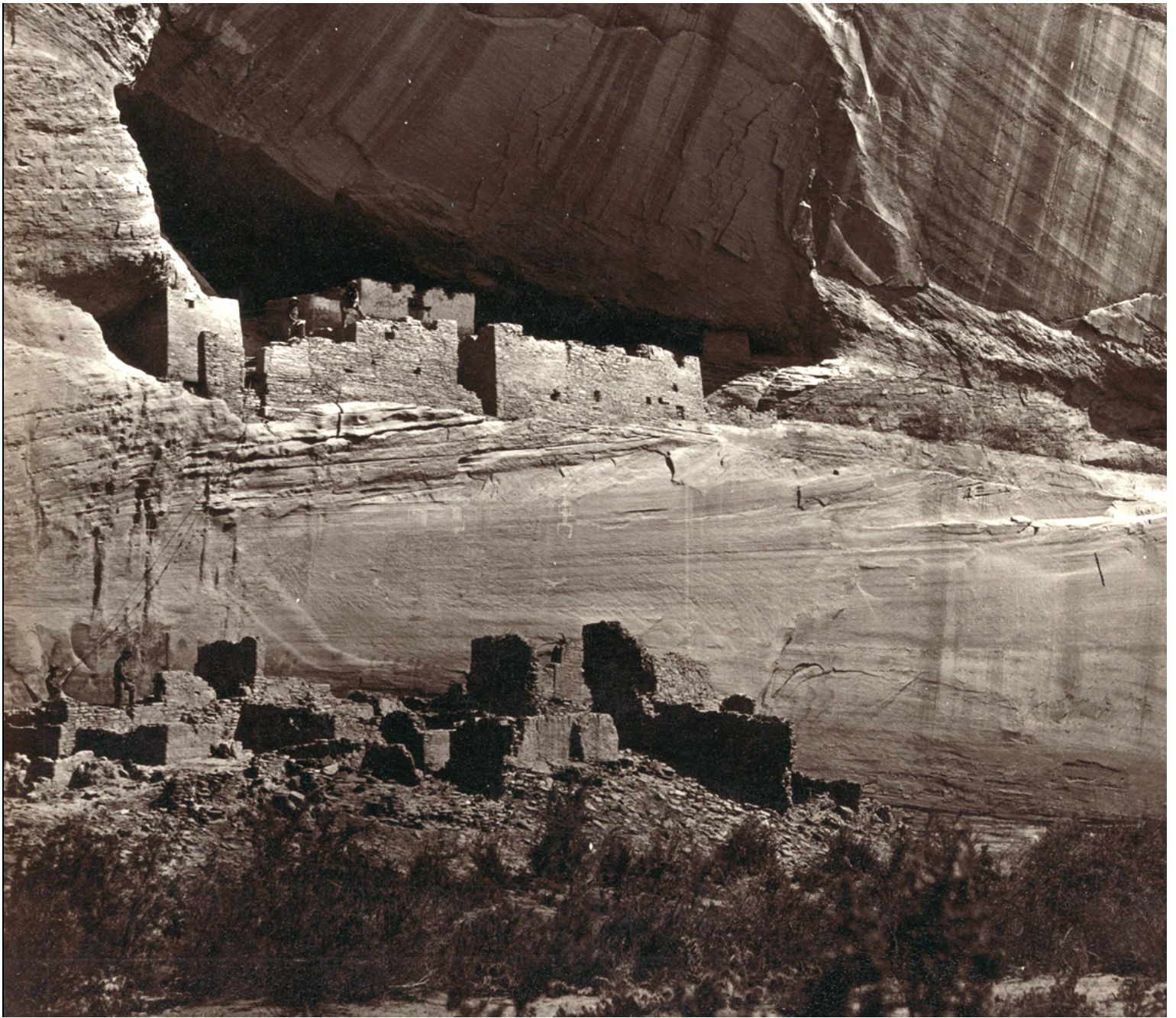
23 View of the White House, Ancestral Pueblo Native American (Anasazi) ruins in Canyon de Chelly, Arizona, in 1873. The cliff dwellings were built by the Anasazi more than 500 years earlier. At bottom, men stand and pose on cliff dwellings in a niche and on ruins on the canyon floor. Climbing ropes connect the groups of men. #