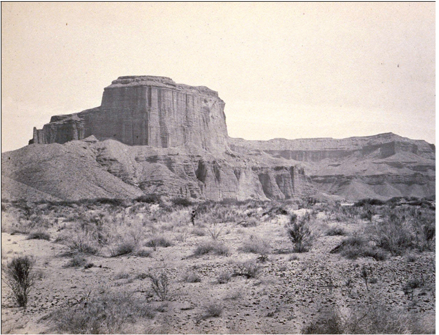
29 Cathedral Mesa, Colorado River, Arizona, 1871. #