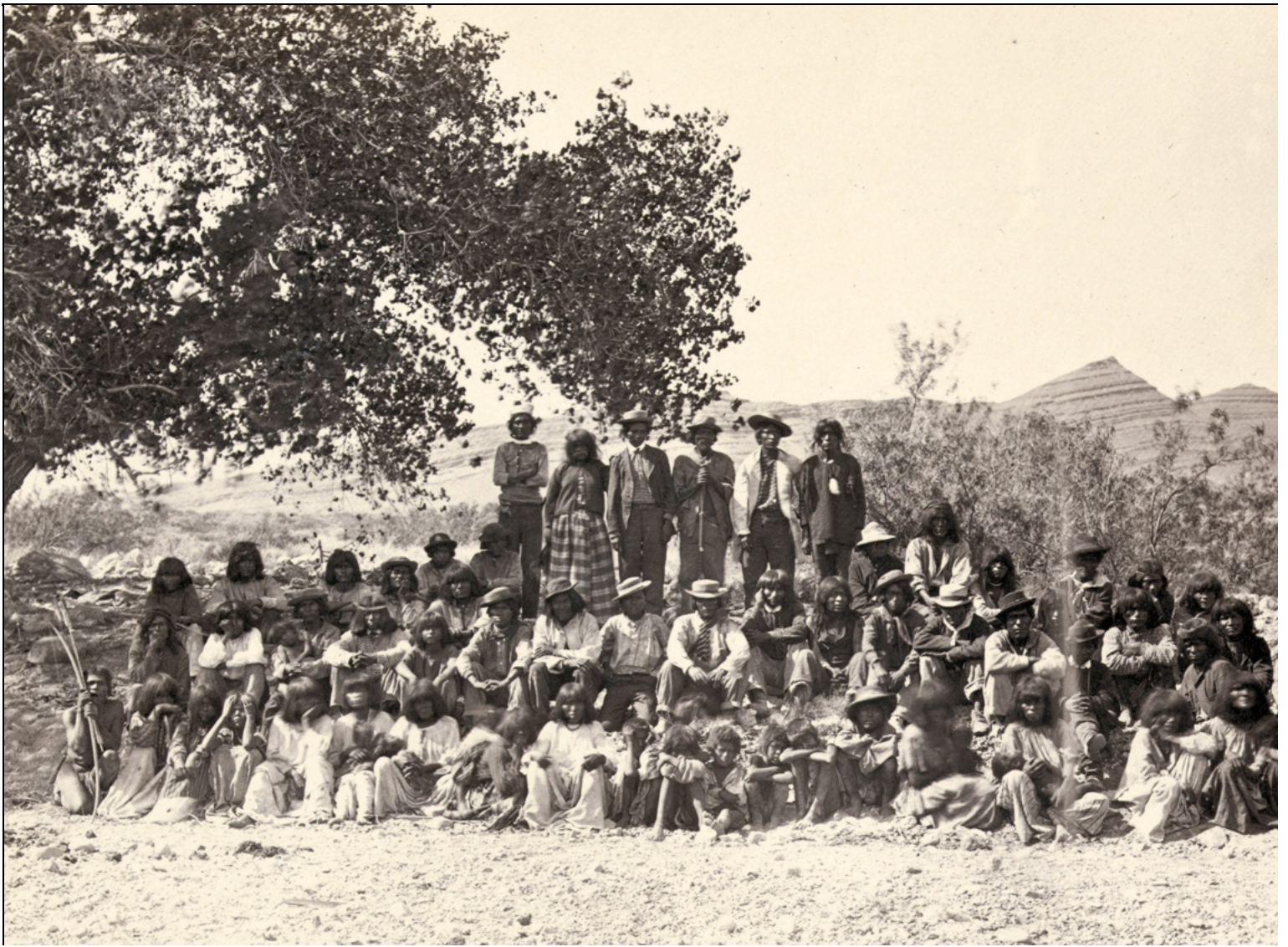
18 Native American (Paiute) men, women and children sit or stand and pose in rows under a tree near probably Cottonwood Springs (Wade County), Nevada, in 1875. #