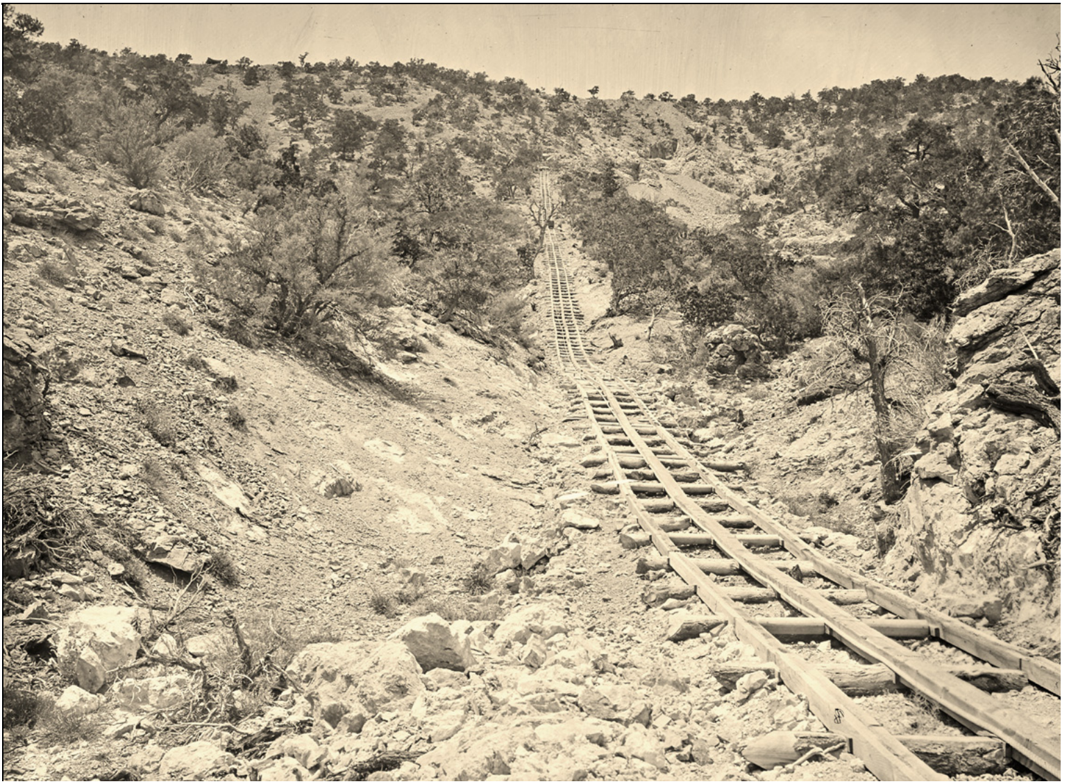
14 A wooden balanced incline used for gold mining, at the Illinois Mine in the Pahrangat Mining District, Nevada in 1871. An ore car would travel on the parallel tracks connected to a pulley wheel at the top of tracks. #