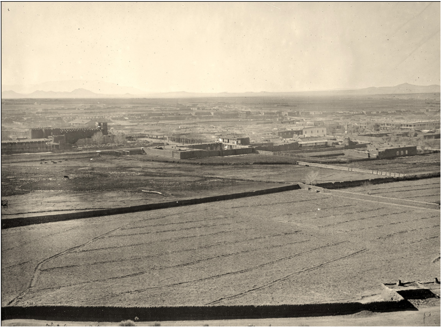
26 A distant view of Santa Fe, New Mexico in 1873. #