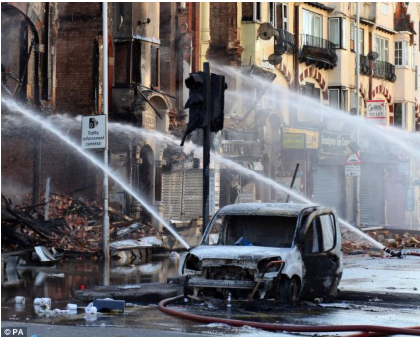
Devastation: The emergency services were stretched beyond capacity as fires raged out of control during rioting

The loping, smirking, shuffling creeps who eventually appeared before the courts were the ultimate losers – the ones who came late to the looting and who were too slow or too stupid to run before they were put in the bag.