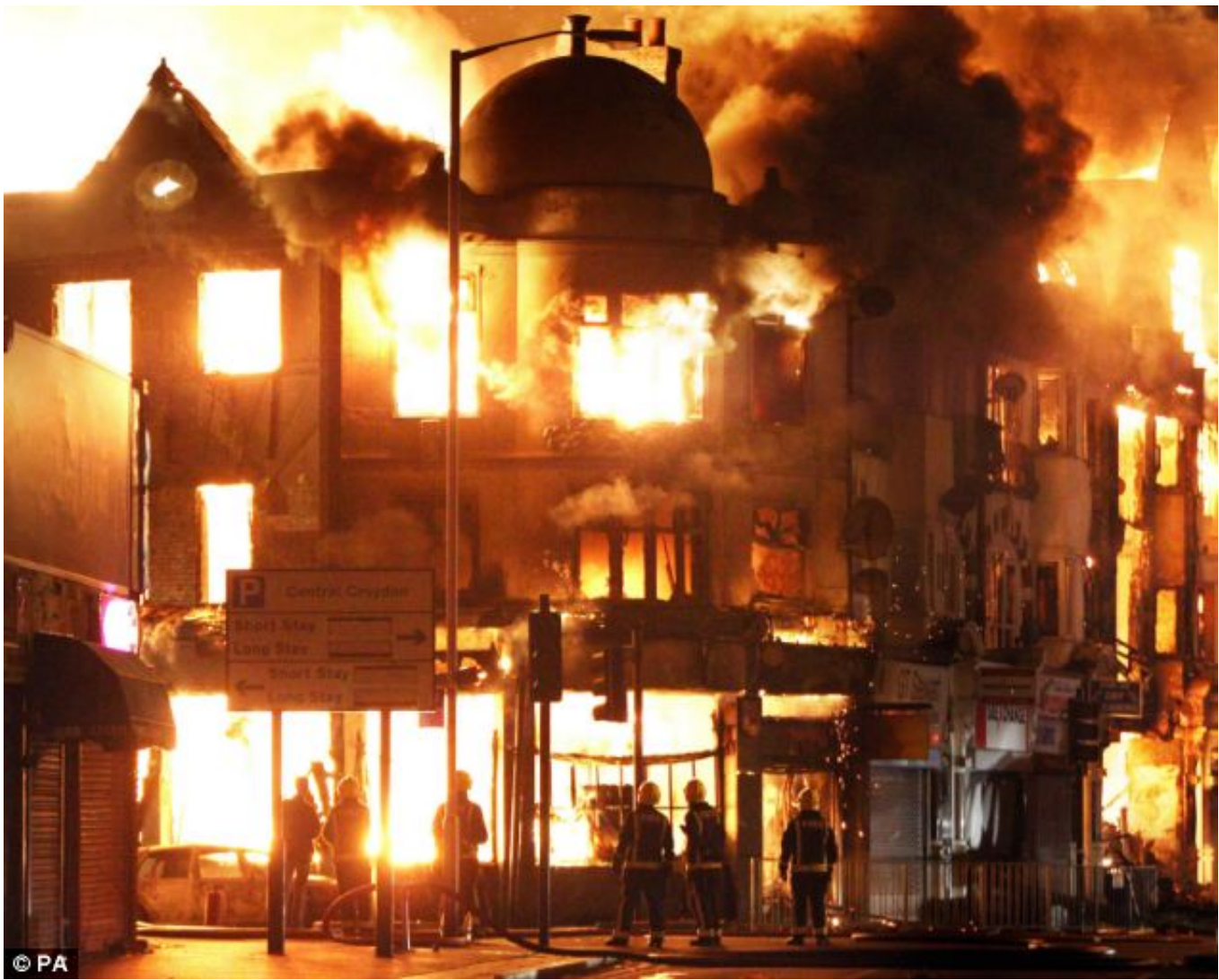
Ablaze: A building in Croydon burns after rioters set it on fire, destroying homes and ruining businesses