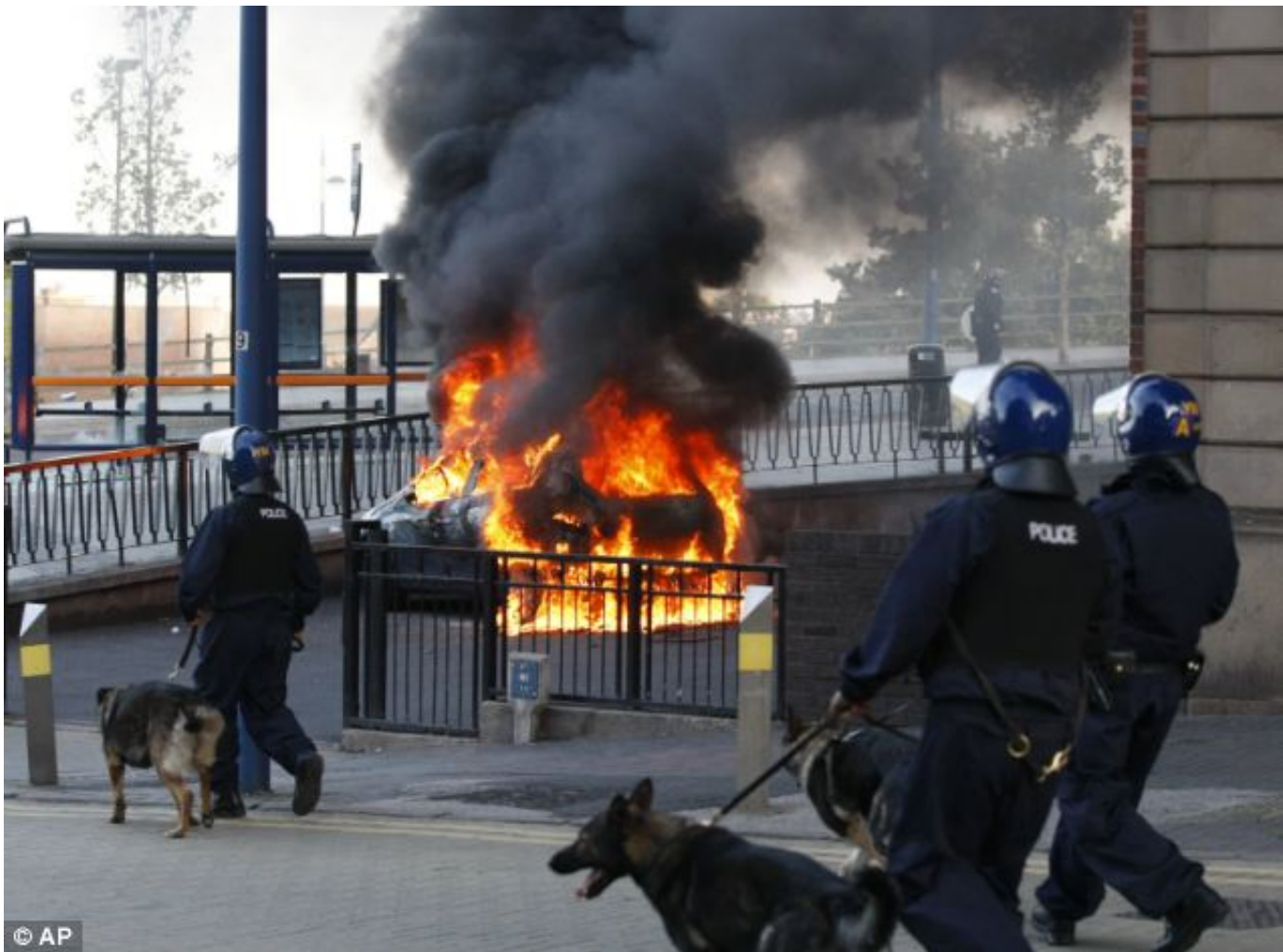
Rioting: The UK has sustained days of violence and senseless crime following the death of a 29-year-old in London last Friday