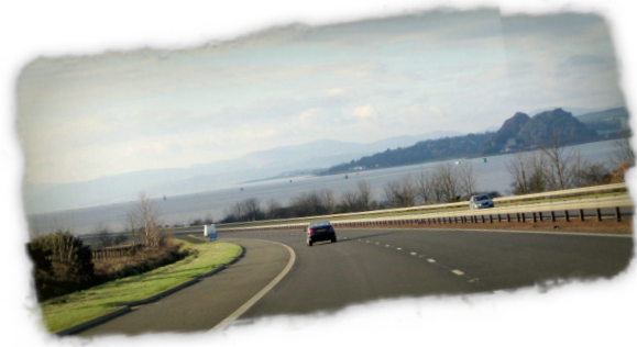
The River Clyde And Estuary Seen from the M8 highway with Dumbarton Rock and Castle in the right background.

The coincidence of Blacks, Jews and Mohammedans (again, not all of the first two but all of the last), who together control the content and structure of the propaganda industry (education and entertainment), is remarkable and worthy of highest awareness. Awareness