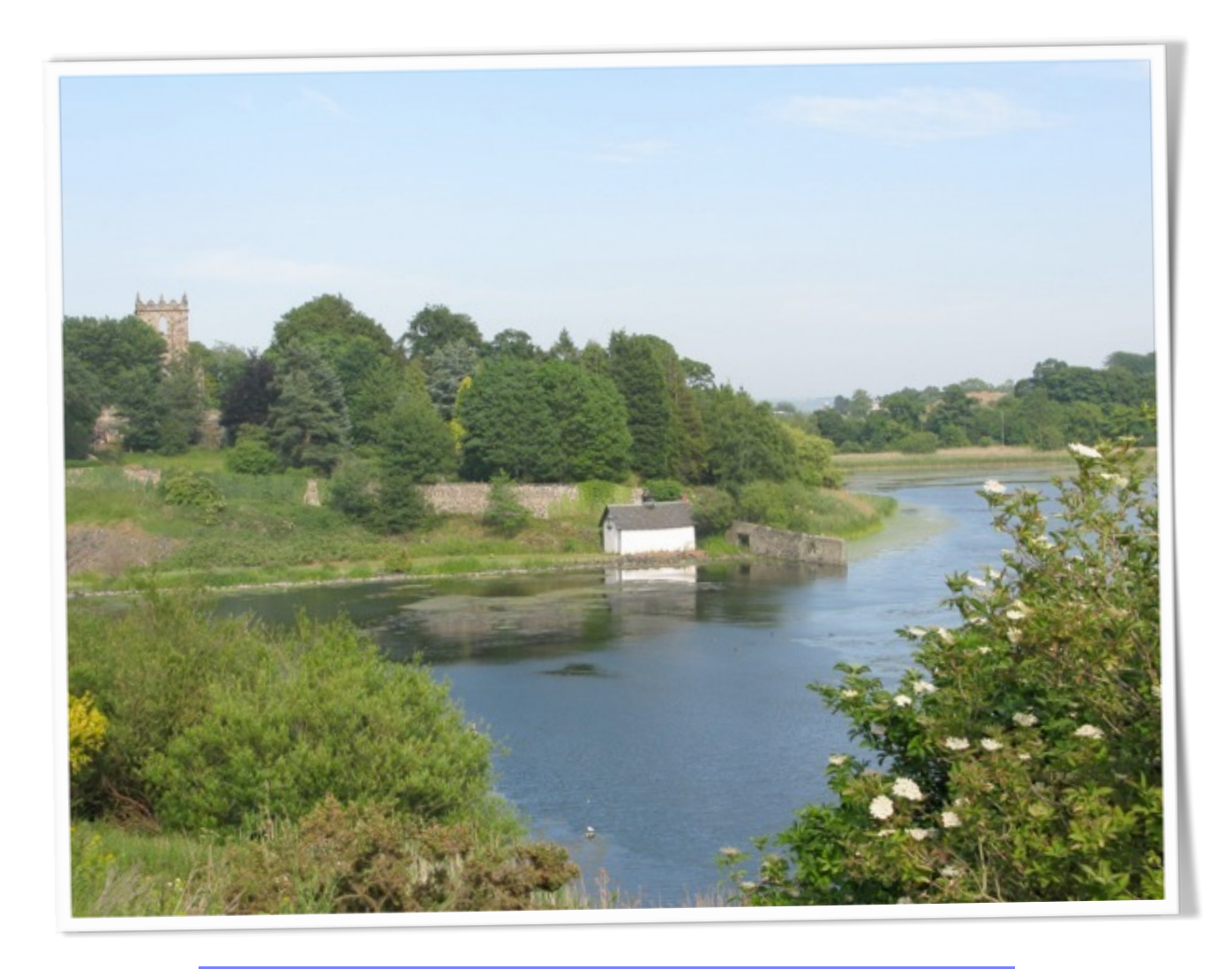
He ventured forth to bring light to the world

The anointed one's pilgrimage to the Holy Land is a miracle in action - and a blessing to all his faithful followers